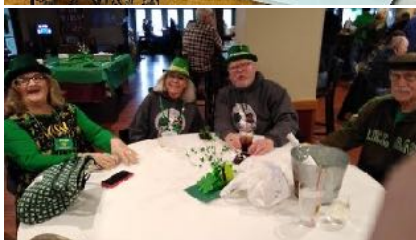
St. Patrick's Day