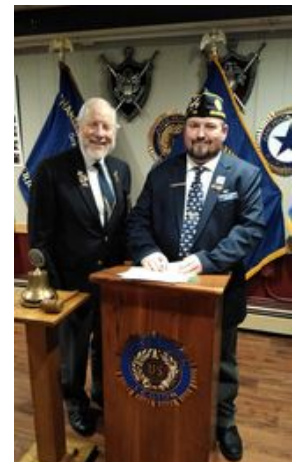
Legion's 105th birthday celebration