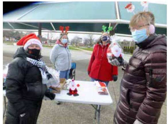
Above - Auxiliary members held an impromptu fundraiser on December 5, raising over $900 for the Poppy Fund.