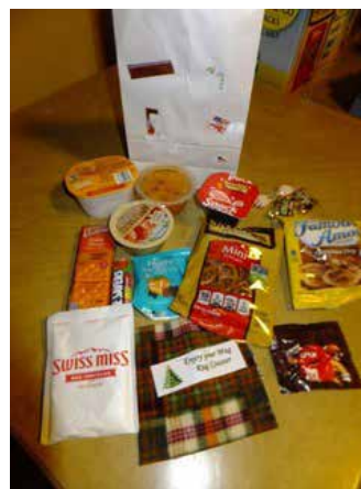
Left - "Bags of Joy" - Continuing the annual tradition, Auxiliary members put together & delivered 375 Christmas "bags of joy" to veterans/veterans' wives living in assisted living/nursing homes.