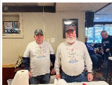
1st Place Gold Medal Chicken Chili

2nd Place & Best Booth Rock Out With Your Crock Out