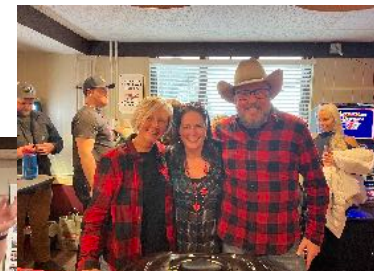
3rd Place Buffalo Posse